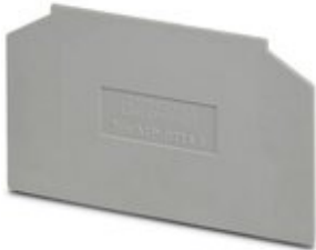
Partition plate, length: 69 mm, width: 1.5 mm, height: 40.8 mm, color: gray

Please be informed that the data shown in this PDF Document is generated from our Online Catalog. Please find the complete data in the user's documentation. Our General Terms of Use for Downloads are valid ( http://phoenixcontact.com/download )